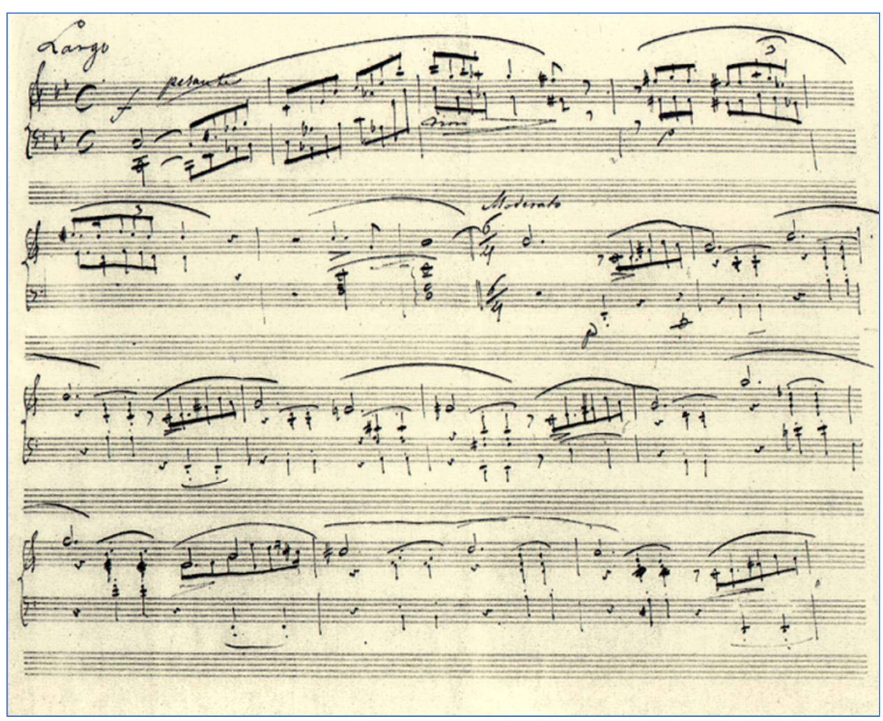
Chopin's manuscript of the Ballade in G minor