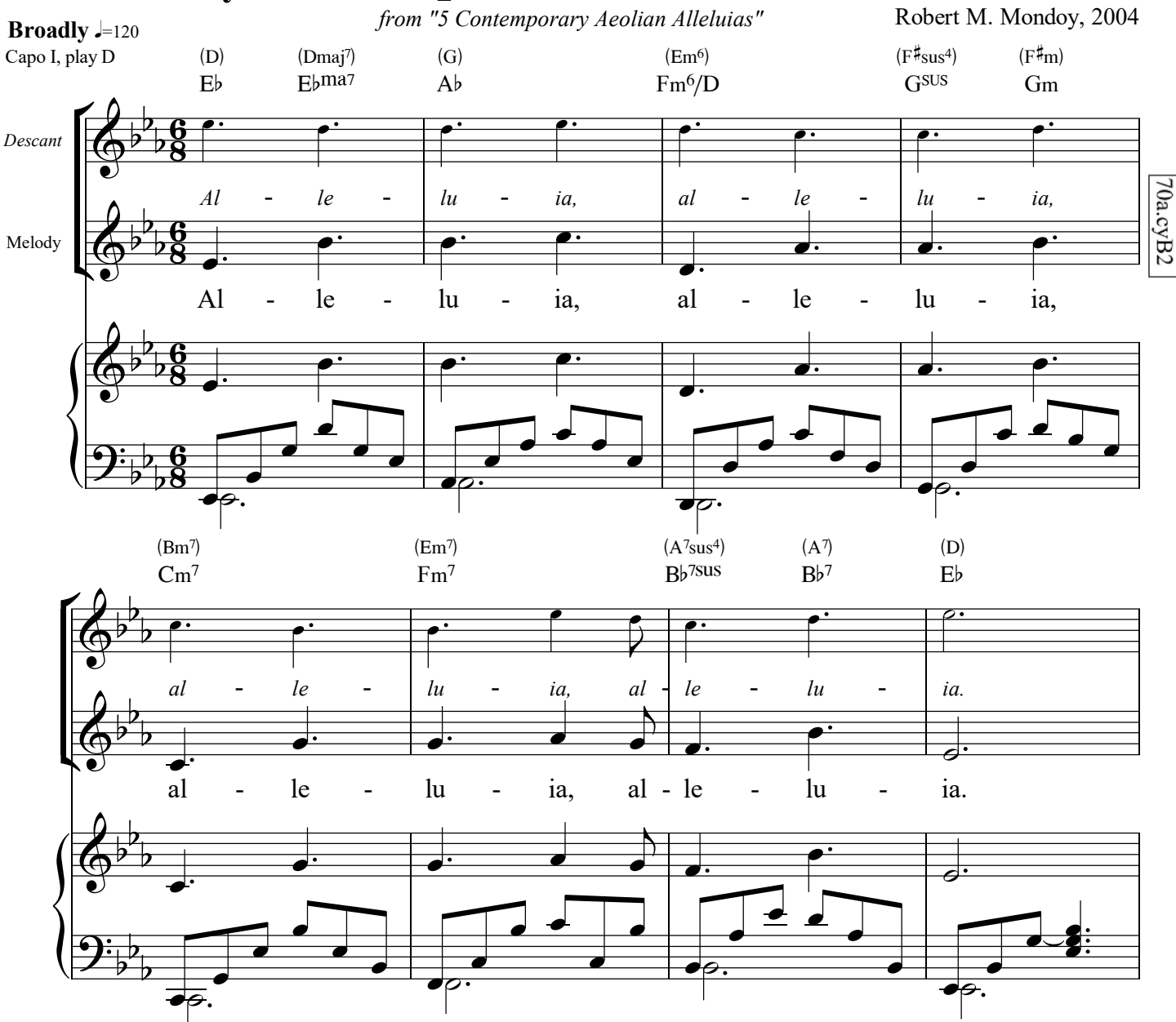
VERSES: Ordinary Time, Cycle B Fall