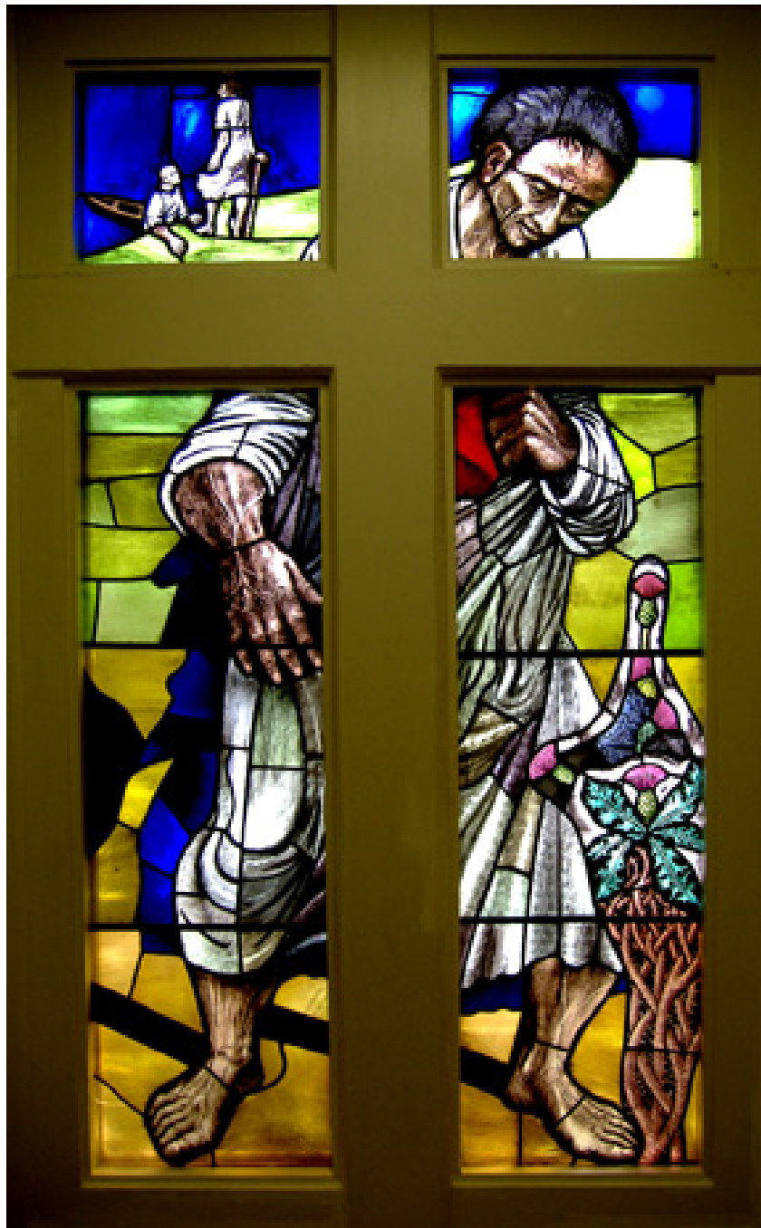
Damien window, Sacred Hearts Center, Kane'ohe Hawai'i (ca. 1970)