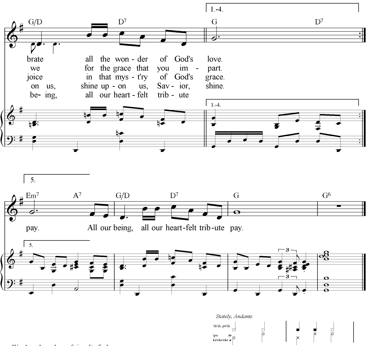
*Vrs. 1 may be used as a refrain and/or final verse