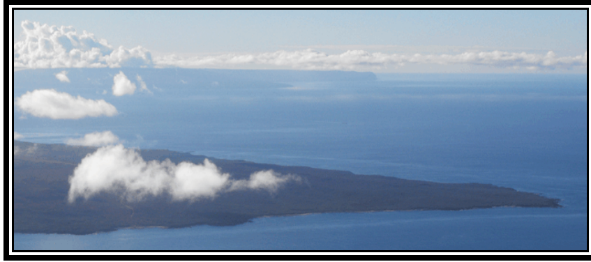
Lā'au Point, Kaiwi Channel in foreground, Kalohi Channel beyond.