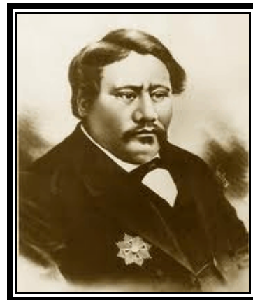
Right: Kamehameha V (Lot Kapuāiwa, 1830-1872) became ruler in 1863.