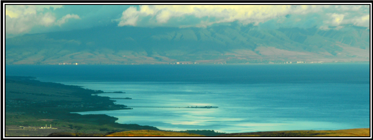
Pālā'au and Kaunakakai wharf beyond it. West Maui (Lahaina is beyond the frame's right edge) in the distance.