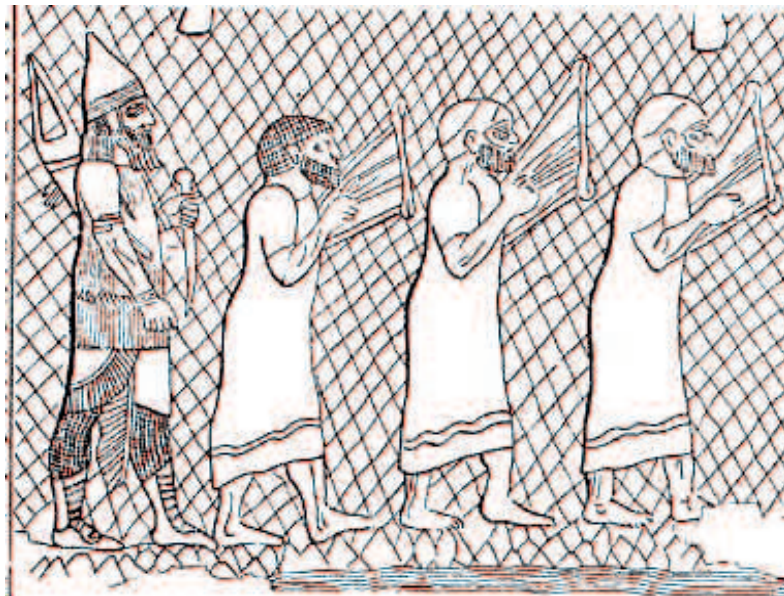
This famous portrait of three Jewish kinnor players (being taken captive by an Assyrian, far left) is excerpted from a bas-relief in the palace of Assurbanipal (705-681 B.C.) at Nineveh, portraying the fall of the Judean city of Lachish.