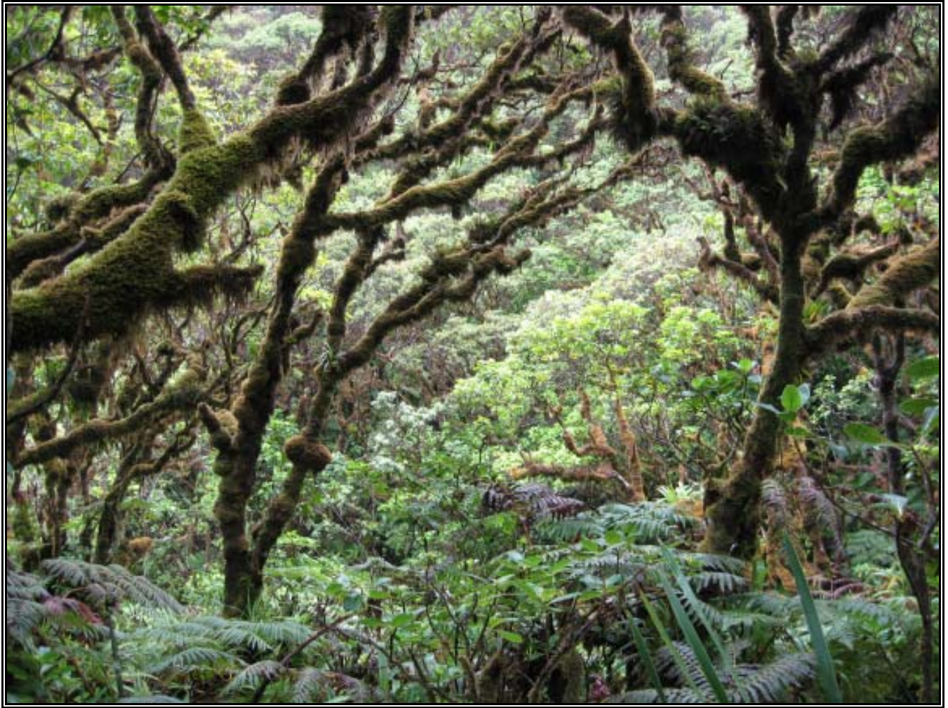
Kamakou Forest Reserve, Moloka'i