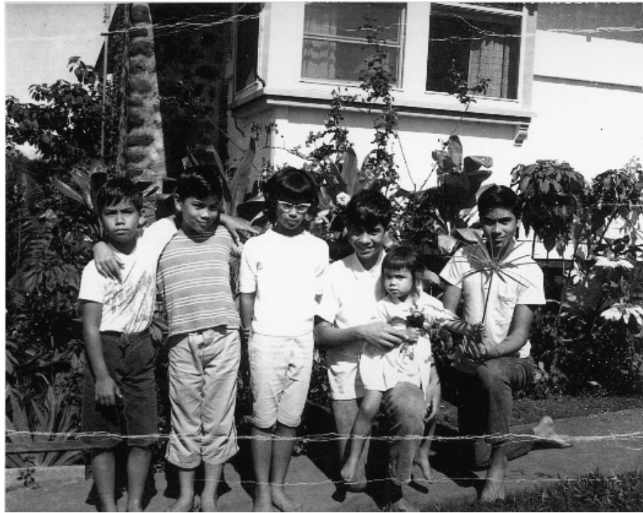
Kala'e, Moloka'i ca. 1966

Except where specifically mentioned, this collection is fondly dedicated to my family, who were the source of my childhood adventures and who are a joy to me always. Aloha me ke pumehana.