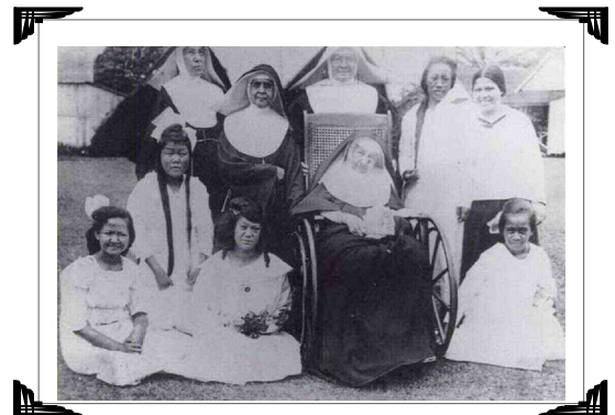
(Right: Mother Marianne with fellow sisters and some of the girls of Baldwin Home, shortly before she died.)